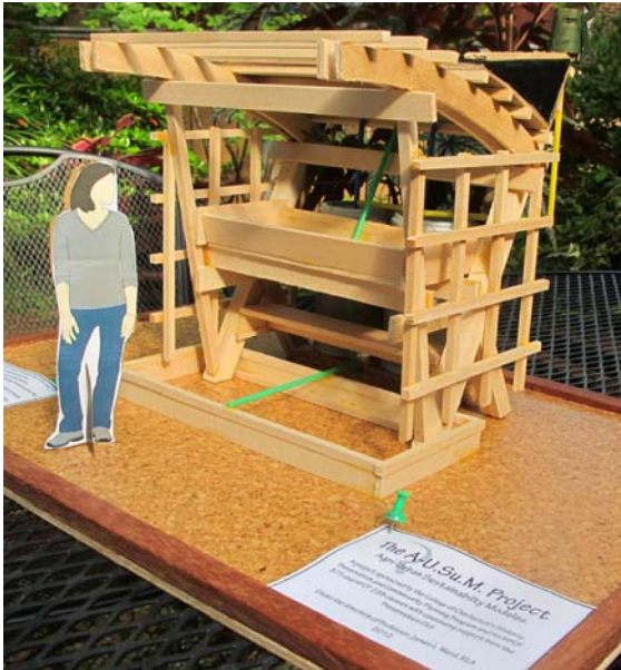
Model Presented to BAR, SHPO and College

1) We will start where last year's students left off with the further development of the planning and implementation of the A-USuM project. On a practical level we need to finalize the water collection systems and prepare it for planting in the spring. We will be working with the Club to accomplish this right away with funding provided to us by the Sustainability Institute. On a planning level, we will be investigating sites where similar units might be made to work around campus. As a final product each class member will prepare a site plan and elevation sketches that will show how they might be used. The Landscape Graphics Manual will be very helpful to get the student thinking analytically and graphically. Supplemental readings and videos will look at small scale urban planning as both a functional and cultural exercise to give substance to the graphics and observations.