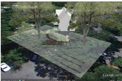
Design Presented to Church from Google Sketch Up and Google Earth

1) We will start where last year's students left off with the further development of the planning and implementation of the A-USuM project. On a practical level we need to finalize the water collection systems and prepare it for planting in the spring. We will be working with the Club to accomplish this right away with funding provided to us by the Sustainability Institute. On a planning level, we will be investigating sites where similar units might be made to work around campus. As a final product each class member will prepare a site plan and elevation sketches that will show how they might be used. The Landscape Graphics Manual will be very helpful to get the student thinking analytically and graphically. Supplemental readings and videos will look at small scale urban planning as both a functional and cultural exercise to give substance to the graphics and observations.